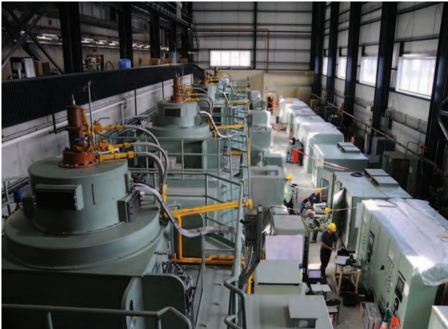
Vertical synchronous generators with TEWAC enclosures

Custom built for various turbine applications, durable Electric Machinery generators can be designed to meet individual arrangement requirements.