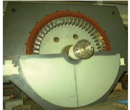
Shop assembly of horizontal generator rated 2.1MW 144 rpm

All generators are assembled and tested in their own bearings at normal operating speed and voltage. Routine tests are performed as required per NEMA MG-1 standard. Bearing temperatures and vibrations are monitored during testing. Additional tests include efficiency, temperature rise, operation at runaway/overspeed condition, etc. All testing is performed in accordance with IEEE procedures.