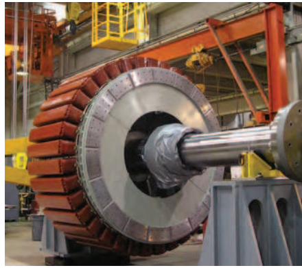
Rotor assembly for 200 rpm vertical generator