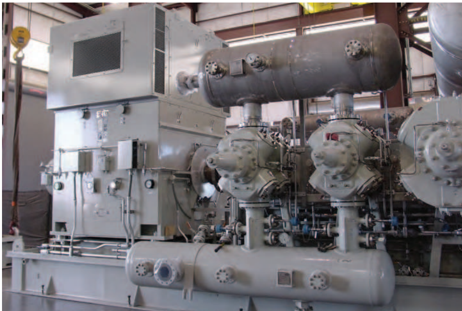
Synchronous motor driving a reciprocating compressor.

Electric Machinery (EM) synchronous motors for reciprocating compressors provide dependable operation and are built to meet design parameters from compressor manufacturers along with on-site electrical requirements.