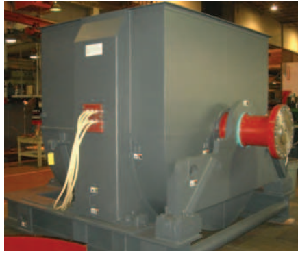
Baseplate with shipping cradle on flanged end.

The brushless excitation system eliminates periodic brush and collector ring maintenance and replacement. Solid state excitation components are rated conservatively to provide dependable service and long life. Electric Machinery EM's Sync-Rite™ system applies the field automatically at the proper rotor angle to ensure smooth synchronization.