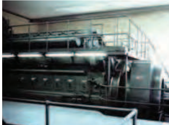
Typical installation of an engine driven generator.