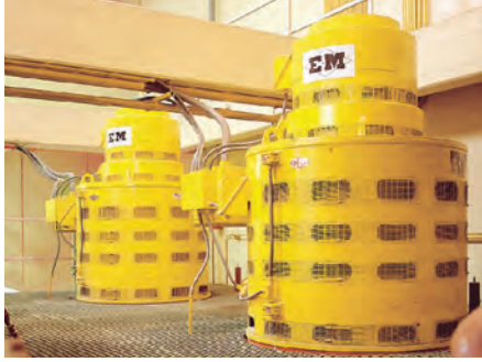
Variable speed municipal pump drive.