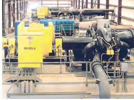
Compressor drive in a petrochemical plant.