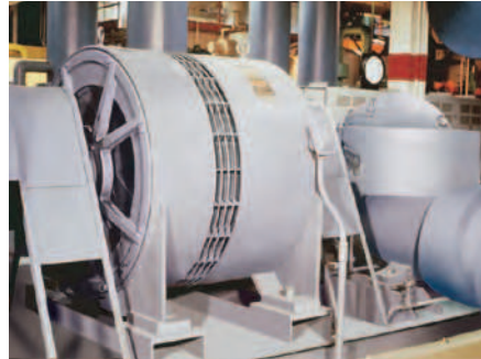
Horizontal drive in pump application.