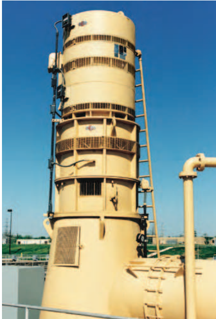
Vertical drive with EM Induction Motor.