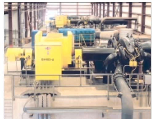
Compressor drive in a petrochemical plant.