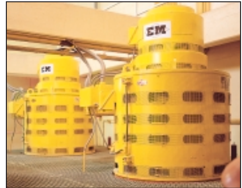
Variable speed municipal pump drive.