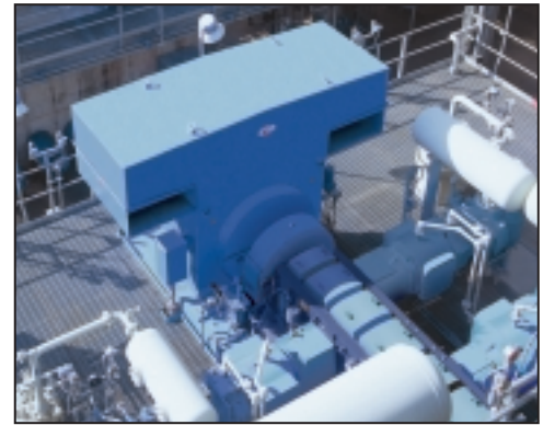
Motor with weather protected enclosure installed in Korea.